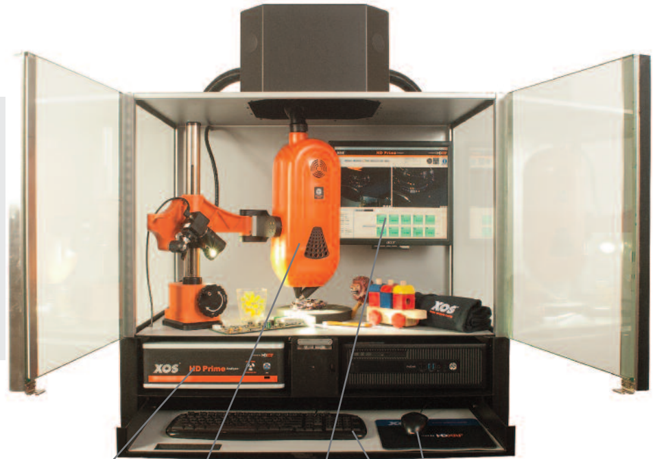
Control box and computer