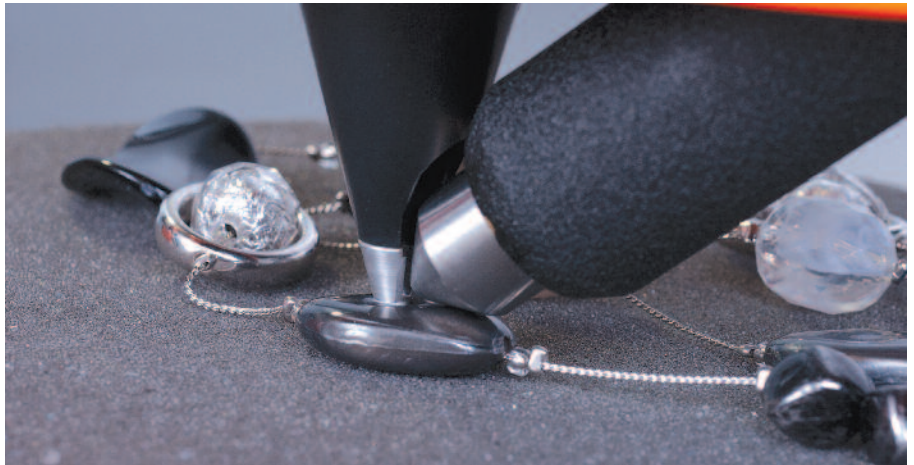
The HD Prime accommodates everything from large toys to small jewelry.